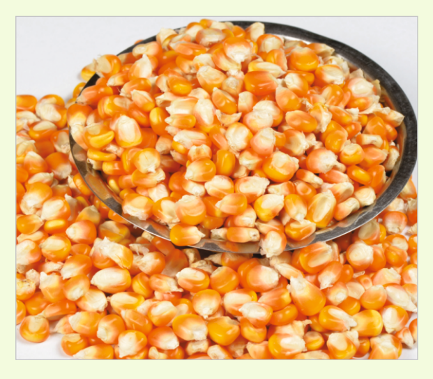
Animal & Poultry Feed