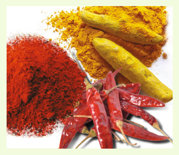
Whole & Ground Spices