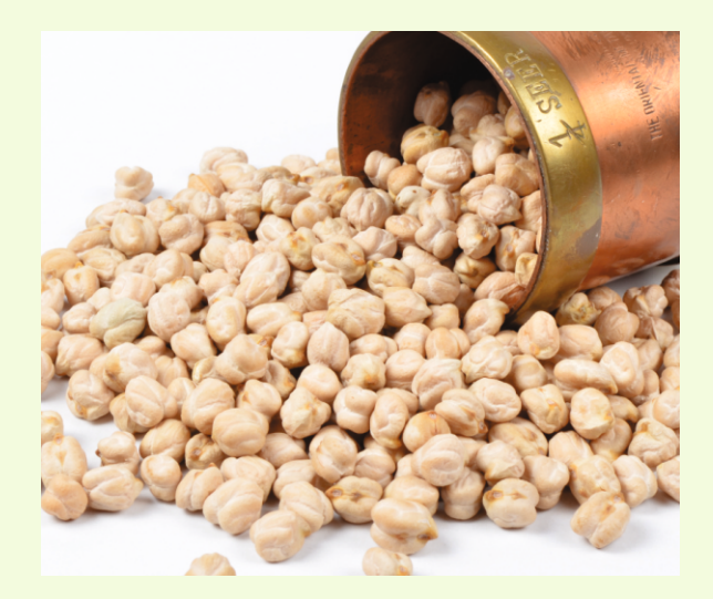
Grains & Pulses