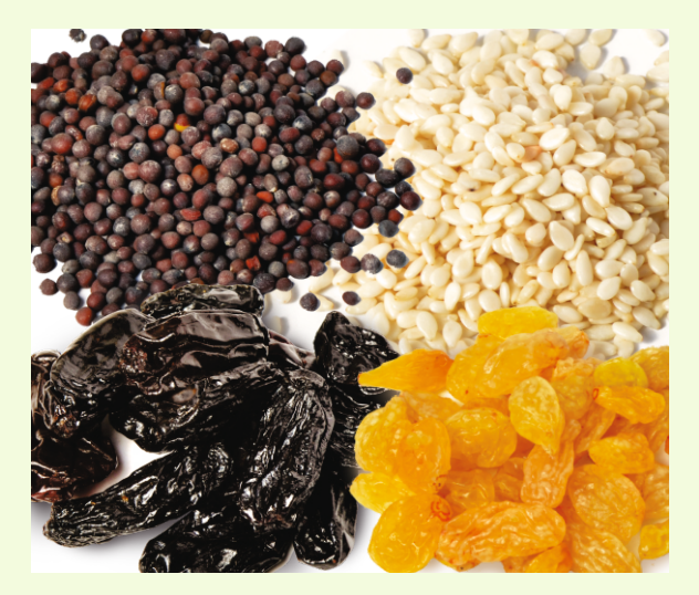
Oil Seeds, Dry Fruits & Nuts