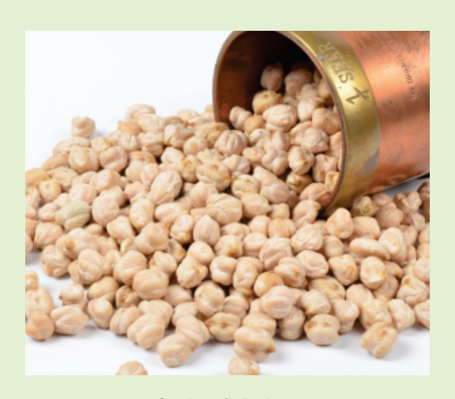
Grains & Pulses