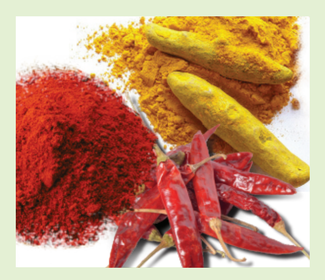
Whole & Ground Spices