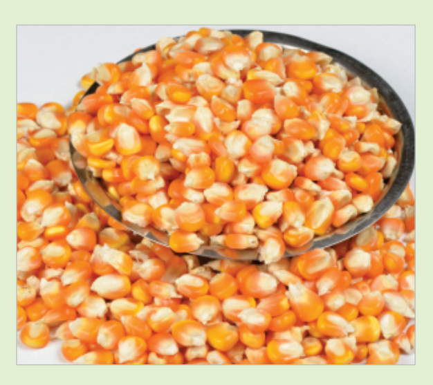
Animal & Poultry Feed