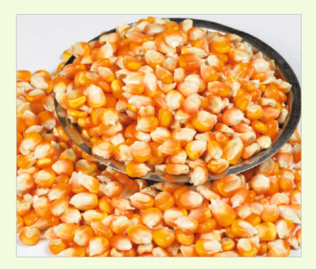
Animal & Poultry Feed