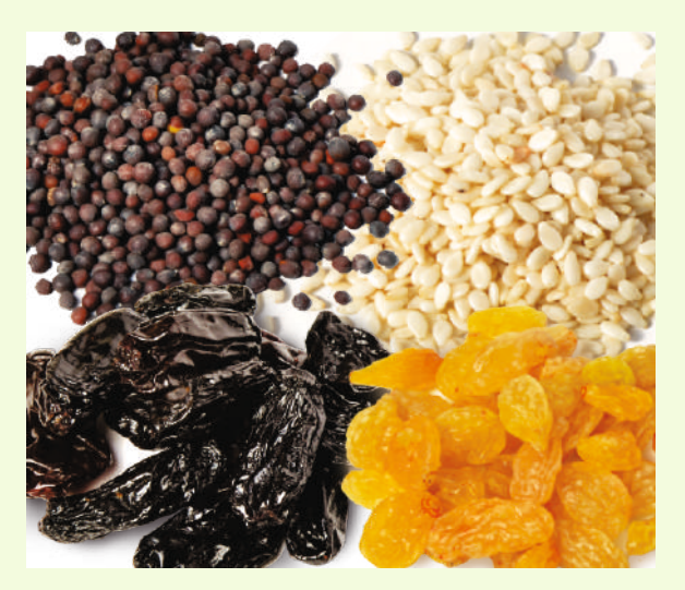
Oil Seeds, Dry Fruits & Nuts