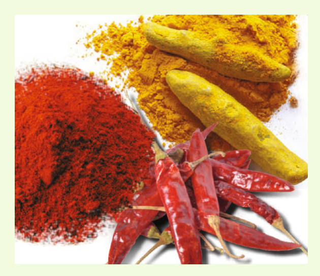
Whole & Ground Spices